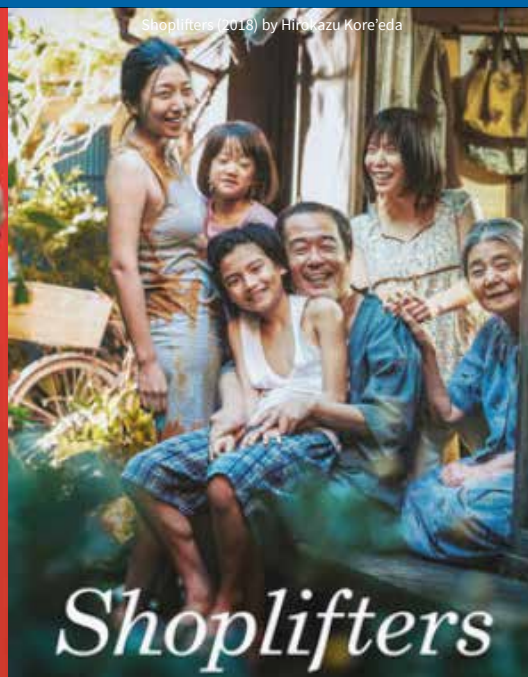
Shoplifters (2018) by Hirokazu Kore'eda