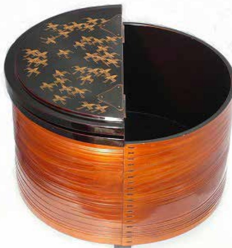
lacquerware with plover motive (Gengensai)