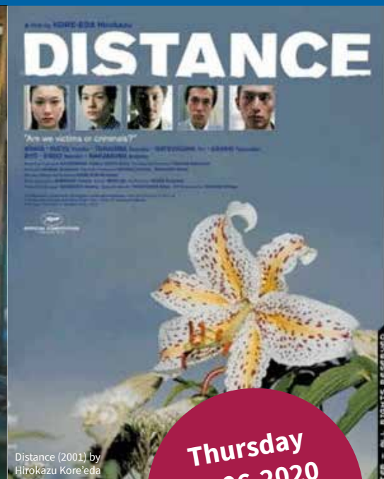
Distance (2001) by Hirokazu Kore'eda

https://japanologie.univie.ac.at/onlinelectures/