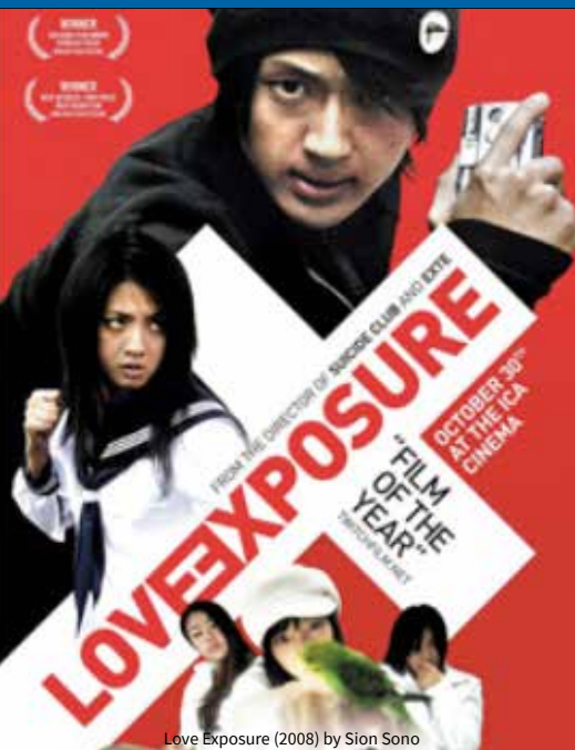
Love Exposure (2008) by Sion Sono

This presentation will discuss the films of the “lost decades” of Japan’s Heisei period (1989–2019)—three decades of economic stagnation, social malaise, and natural disaster. Through an examination of the films of major Heisei filmmakers—including Kurosawa Kiyoshi, Ichikawa Jun, Kore-eda Hirokazu, Sono Shion, and others—it explores the dissonance between the dominant history of Japan’s recent past and the representation of this past in the popular imagination of the period. Along with posing a challenge to normative accounts of history, Heisei film, this presentation will also suggest, explores new forms of referentiality between contemporary Japan and its past.